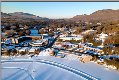
High Peaks Resort