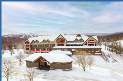
Killington Mountain Lodge